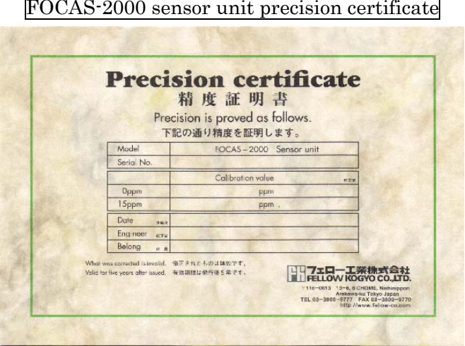
FOCAS-2000 sensor unit precision certificate

Please request the sensor unit (with precision certificate) to our office or our company's representative offices. We will send the sensor unit with replacement manual, ship's crew can replace with new sensor unit.