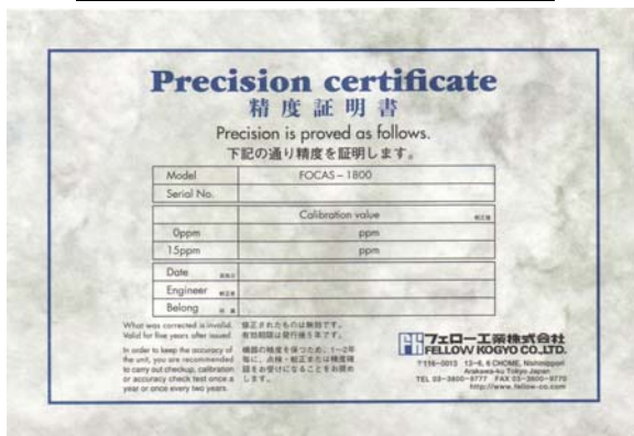
FOCAS-1800 precision certificate